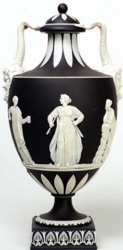
Wedgwood Jasper Vase with cover; Shape No 1, black dip with white relief of Muses, c. 1875.

Art, science and a quest for perfection are unmistakable in the refined and classical ceramics of Wedgwood.